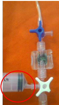
Locked Off Position

You are now ready to complete the Dorado KT Transducer 'Zero All' Procedure